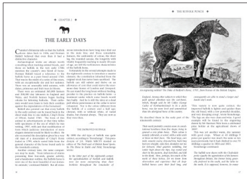
Example of a double page spread.