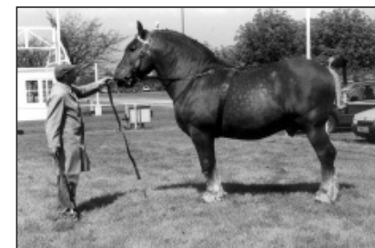
Colony Windsor, 1996.